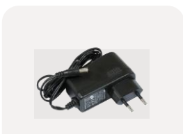
24 V 0.38 A power adapter